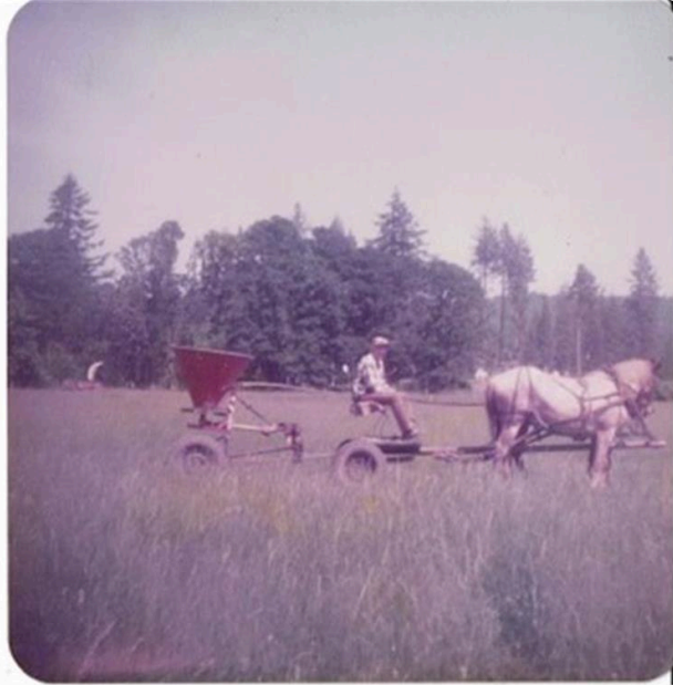
Dad's Preferred Tractor