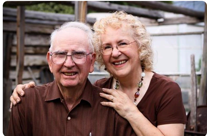
One of our favorite pics